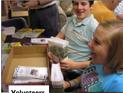
Volunteers worked hard preparing for General Assembly

In early June CLA volunteers worked daily putting eight thousand CLA brochures, donation cards and self-addressed envelopes into 3,000 copies of Battle With a Crocodile and 5,000 copies of the new book, Cape Verde: A Fruitful Branch .